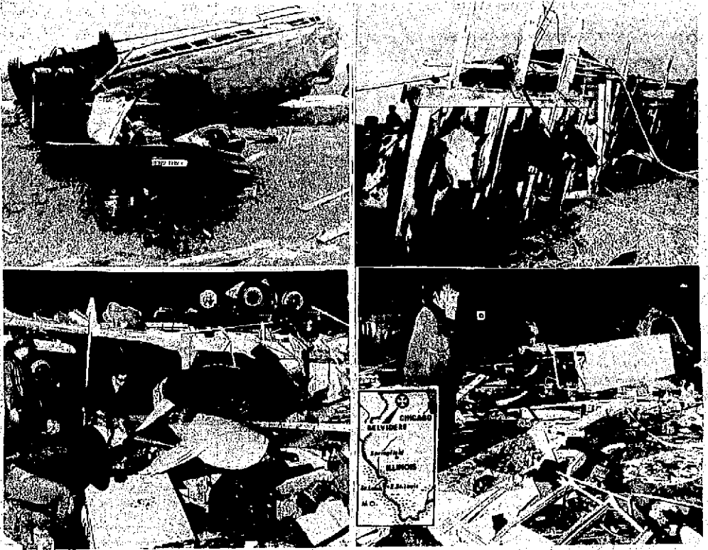
WRECKAGE OF a school bus (upper left) lies near Harvard. Bus driver Boyd Jones saw the tornado coming, emptied the bus of children and told them to lie in a ditch. None were seriously injured. (Upper right) A row of cows munch their hay in stanchions after a twister lifted the barn over them near Harvard, Ill., and spread it in a nearby